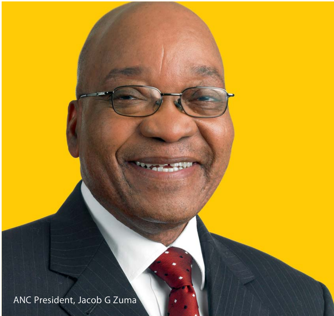
ANC President, Jacob G Zuma